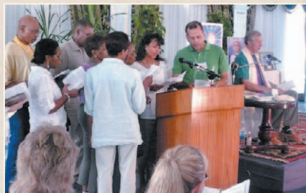
Meru University Class Luxor Pilgrimage 2006

Meru University, the adult educational component of The Hearts Center, is a modern-day mystery school that facilitates the spiritual development of the soul. The university is dedicated to the sharing of ageless wisdom and progressive revelation through courses, seminars, workshops, publications and projects. These courses assist seekers in understanding the