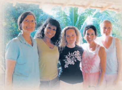
Easter Pilgrimage Imbassai, Brazil 2007

path are key to giving our life greater meaning and joy.